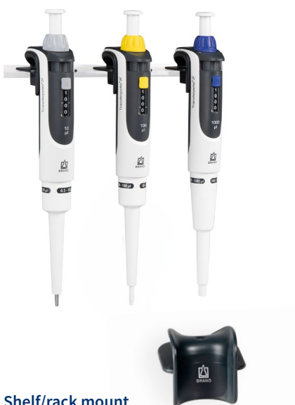
Shelf/rack mount for 1 Transferpette® S single- or multi-channel pipette.

With holders and stands, the devices are always properly stored and close at hand for the next application.