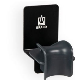
Wall mount for 1 Transferpette® S single- or multi-channel pipette.