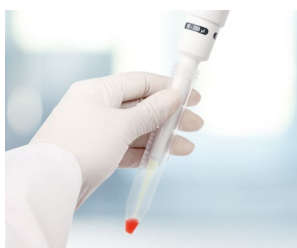
Narrow centrifuge tubes