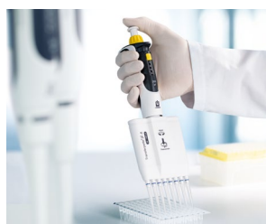
Working with PCR plates