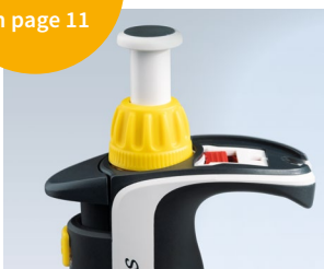
Easy Calibration technology