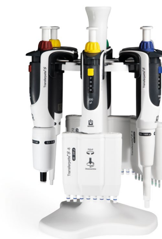
Bench top rack for 6 Transferpette® S single- or multi-channel pipettes.