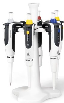
Pipette Package 2