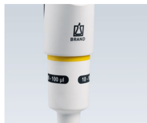
Integrated shaft coupling