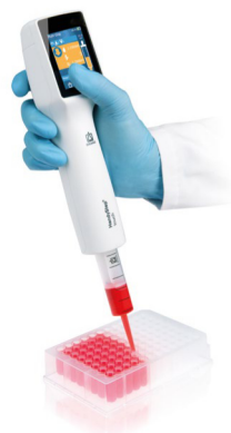
Multi dispensing with the HandyStep® touch and PD-Tip //

The HandyStep® touch saves time and prevents errors through automatic tip size recognition of the PD-Tips // from BRAND, with patented coding on the pistons. After inserting the tip, the size is automatically recognized and displayed, making it easy to select the volume to be dispensed. When a new PD-Tip // of the same size is inserted, all instrument settings are maintained.