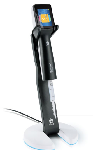
Charging stand with HandyStep® touch S and PD-Tip //

Ergonomically arranged STEP button for effortless volume filling and delivery