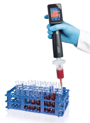
Sequential dispensing with the HandyStep® touch S and PD-Tip //