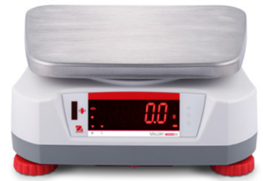
Rear Display with Integrated Touchless Sensor